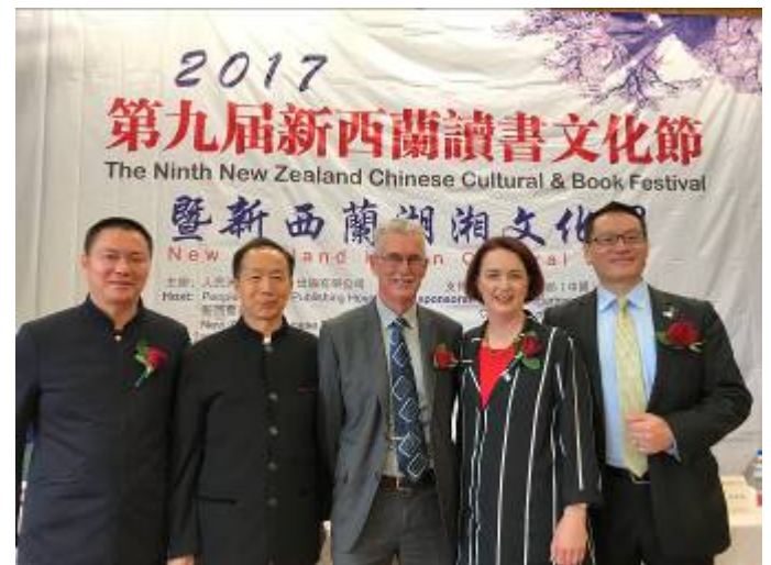
Bottom Right: Mr Black with the Chinese representatives and the NZ Parliamentary representatives